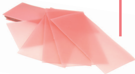
R3711-00 MODELLING WAX

Highly soft wax in strips which bends at room temperature without breaking. Thanks to its good adherence and high workability, it serves to border the impressions to obtain the base of the mould. Pack of 24 strips