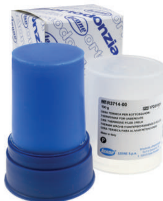
R3714-00 THERMOWAX FOR UNDERCUTS

Necessary for taking accurate occlusal impressions. Special aluminium foil laminated, it lessens distortions. Pleasantly scented, 6 mm thick. Pack of 24