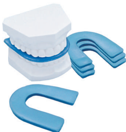
R3730-00 BITE WAX

Wax in sheets. It moulds, both cold and hot, without breaking. Pack of 500 g