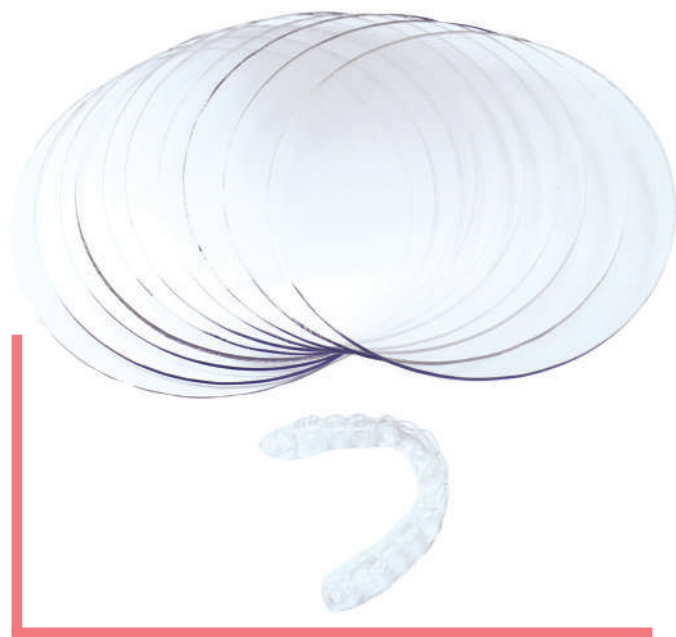
THERMOFORMABLE DISCS Ø 120 mm

The material conforms to ISO 10993-1, and once formed, it features excellent optical transparency, with highly efficient biomechanical properties.