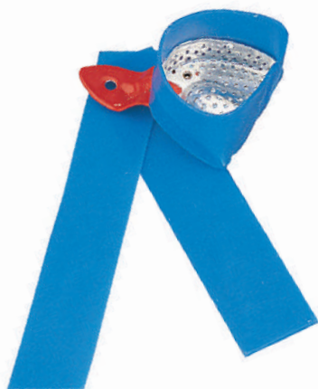
R3710-00 UTILITY WAX

Wax in 30 cm long sticks, 3x3 mm cross section. The special adherence and high workability make it useful to border the impression trays to fit the edges of the functional impression. Pack of 90 sticks