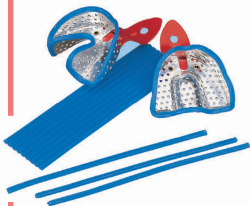
R3712-00 QUADRANGULAR WAX STICKS

Wax in 30 cm long sticks, 3x3 mm cross section. The special adherence and high workability make it useful to border the impression trays to fit the edges of the functional impression. Pack of 90 sticks