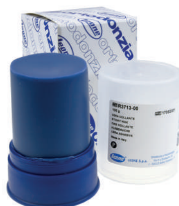
R3713-00 STICKY WAX

High melting point: 104° C. Particularly suitable to eliminate undercuts. It prevents damage to be caused to the acrylic brightness. Pack of 100 g in stick